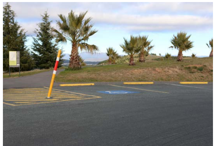
Parking - Wide Brown Land / Himalayan Cedar Forest