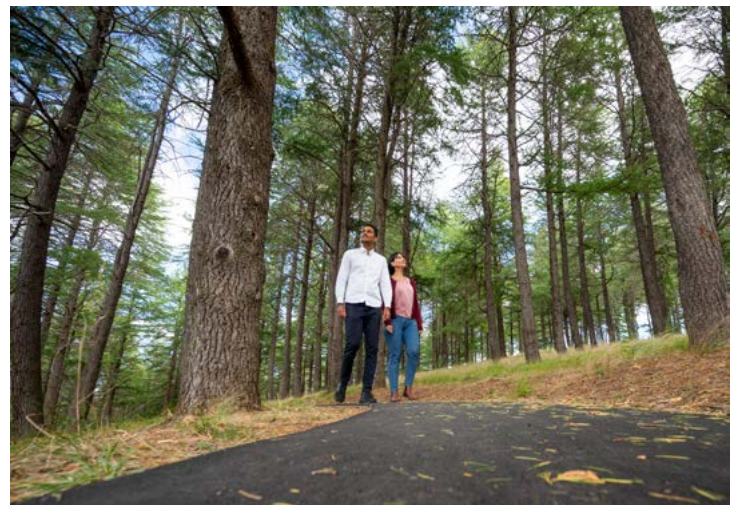
Paths in Himalayan Cedar Forest