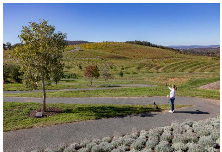
Central Valley Path