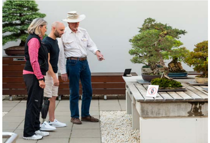
Guided Tours in Bonsai Collection

Unfortunately, our Ngala Bus is not wheelchair accessible and requires limited mobility to climb three steps on to the bus.