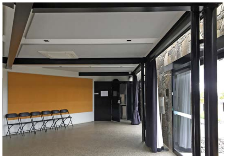
Terrace Room - Birthday Party & Activity Venue

Yes, many of our school holiday programs can be adapted to be inclusive of all abilities. Please get in touch with our friendly educational staff on 02 6207 8484 or email arboretum@act.gov.au if there is a particular program you are interested in.