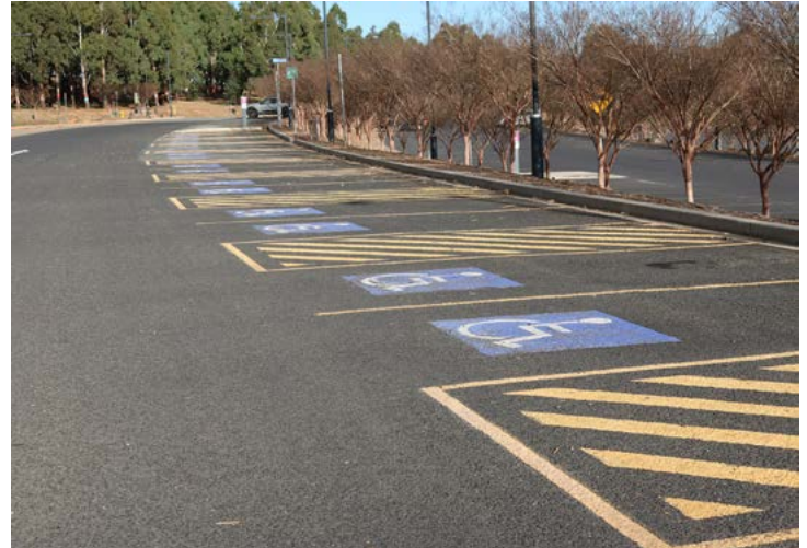
Parking - Visitors Centre / Main Carpark

A 200 metre (return) level and sealed pathway provides access to our lookout and Wide Brown Land Sculpture. The parking, path and lookout are exposed to all elements of weather.