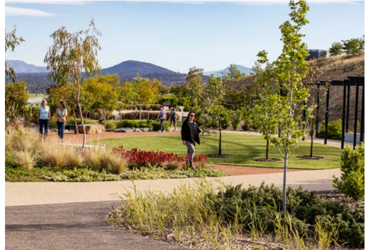
Paths in Gallery of Gardens

Central Valley Path: 1.5 kilometre one way (sealed path, some gradient). Starting from the Northern Deck of the Visitor Centre, follow the slope down towards the Ginkgo Dam. Explore the ceremonial tree plantings and feature gardens in the zigs and zags of the Central Valley. For mobility impaired guests and young children, we recommend an accompanying guest bring the car to collect walkers at the Ginkgo Dam, at the base of Central Valley.