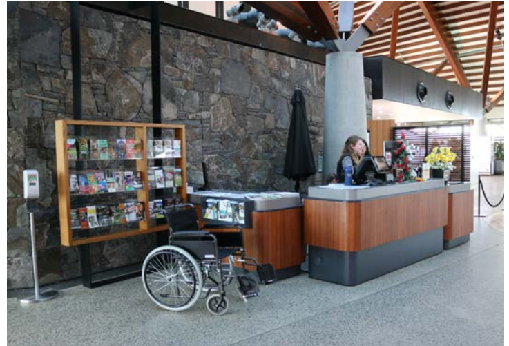
Visitors Services Officers & Information Desk

The 'EasyPark' app is used at all ACT Government metered parking sites.