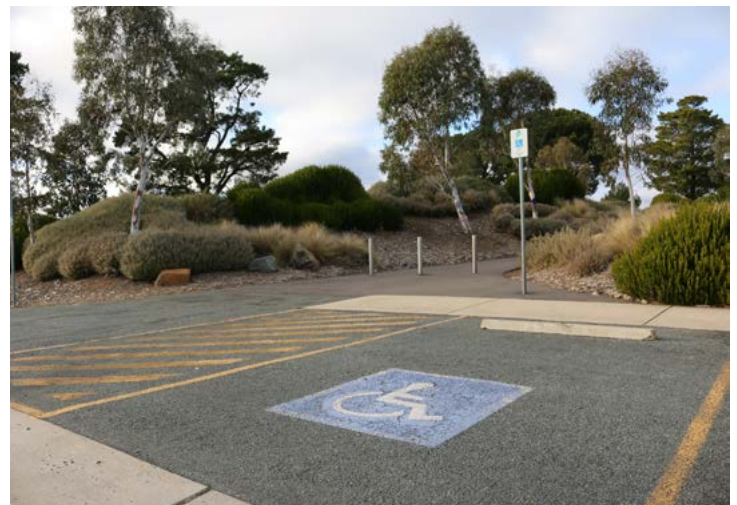
Parking - Dairy Farmers Hill Lookout