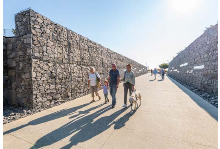
The Cutting / Arrival Path

We refer to this entrance ramp as 'The Cutting'. There is a concrete bench seat at the top of the cutting, adjacent to the carpark, for companion drop-off. There is another concrete bench seat midway down The Cutting. This path is semi-sheltered from wind but exposed to sun and rain.