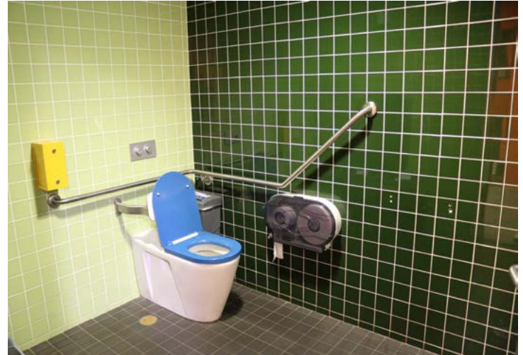
Accessible Toilet - Visitors Centre

There are many relaxing gardens to sit in, or our staff may be able to provide access to the First Aid room or Bugang room if not currently in use*.