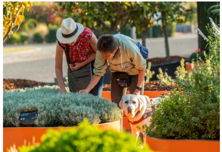
The Sensory Garden

All domestic dogs are welcome to walk the exterior grounds on lead. Domestic pets are not allowed in the Village Centre, Bonsai Collection or Pod Playground.