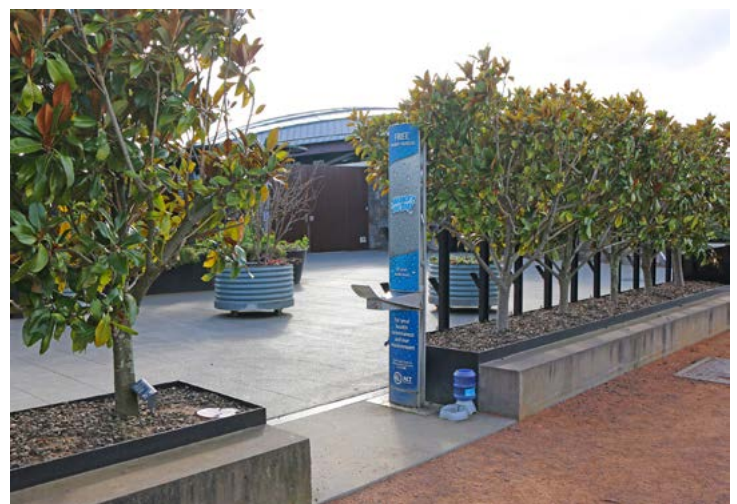
Water Station & Animal Water