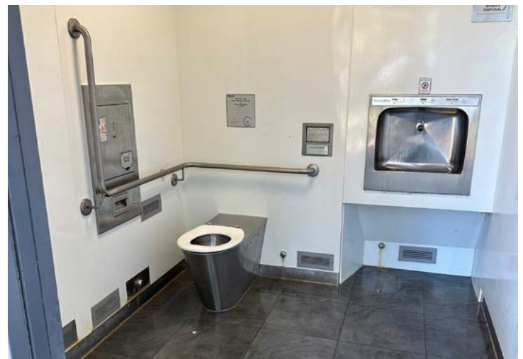
Accessible Toilet - Himalayan Cedar Forest